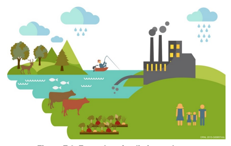
Figure E.2. Examples of radiation pathways

People can be exposed to radionuclides in the environment through a number of routes, as shown in Figure E.2. Potential routes for internal and external exposure are referred to as pathways. For example, radionuclides in air could be inhaled directly or could fall on grass in a pasture. If the grass were then consumed by cows, it would be possible for the radionuclides to impact the cow's milk, and people drinking the milk would be exposed to this radiation. Similarly, radionuclides in water could be ingested by fish, and fishermen or other consumers could then ingest the radionuclides in the fish tissue. People swimming in the water also would be exposed. Exposure to ionizing radiation varies significantly with geographic location, diet, drinking water source, and building construction.